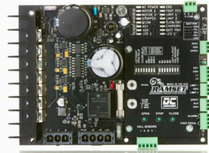
DC DRIVER BOARD

All Ramset DC models use the same two boards