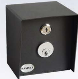
Key Switch Box Suitable for use on entry doors where access is restricted by a key.