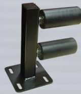
Adjustable Guide Rollers Heavy duty UHMW rollers adjust to fit any gate. Lengths: 4", 6", 12"