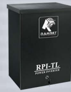
RPI (Ramset Power Inverter) Maintains power to your operator and accessories when the main power is lost. 750W output.