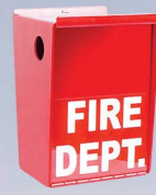
Chain Drop Box Mechanical chain release fire box designed for use on sliding gates.