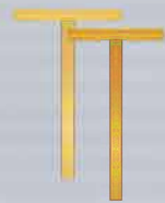
Post Mounts 1/4" angle iron flats. 3/16" square tubing legs. Used to mount the operator off the ground.