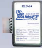
RLD-24 Loop Detector A safety device that stops the gate from closing on a vehicle.