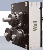
Thru-Wall Extension Extends drive sprocket & idlers thru-wall. Keeps operator inside property/ building.