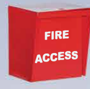
RAMSET Fire Box Allows the fire department to open your gate in the case of an emergency.