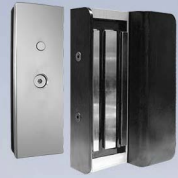
Magnetic Lock 12/24V DC. 1100 lb holding force. Secures the gate(s) closed.