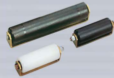
Premium Guide Rollers Heavy duty UHMW rollers. Lengths: 4", 6", 12" Colors: Black or White