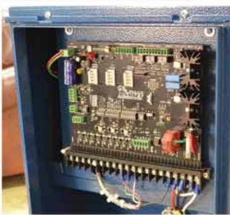
Control box can be mounted on either side or separately