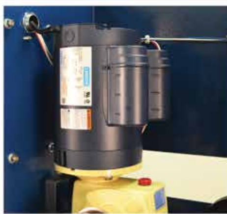
1 HP Motor - 115/230 VAC